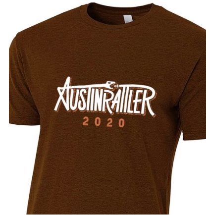
2020 MTB Participant Shirt

Get your participant shirt (pictured), race plate and answers to your race-day questions. Photo ID is required. Packets must be picked up in person. They will not be given to others. *Lines will form by last name. PLEASE keep 6' distance.