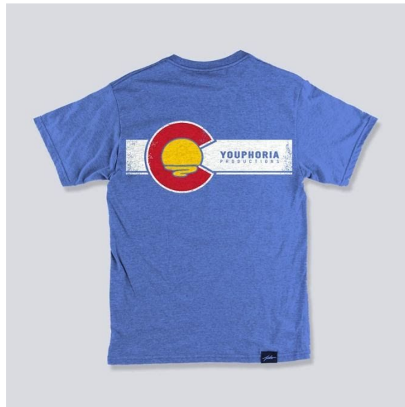
2020 Retail Shirt

Visit our retail tent throughout the weekend and check out our retail T-shirts and water bottles.